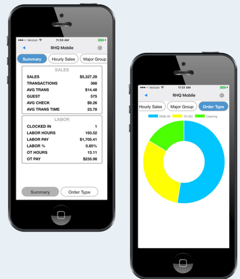
Real-Time POS Data Pushed to your Phone